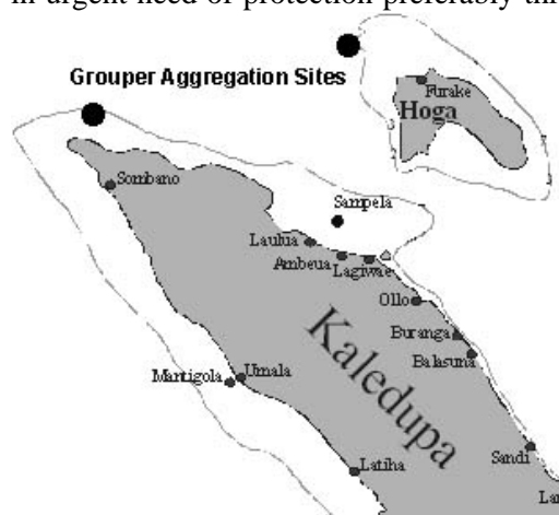
Figure 4. Known grouper aggregation sites (May 2003)

Currently two known sites of grouper aggregation (See figure 4) are highly exploited. These sites are in urgent need of protection preferably through No-Fishing Areas. Other aggregation sites may well exist that have yet to be identified, these are also likely under threat, research currently being undertaken by WWF/TNC will determine the location of these sites allowing for their future management.