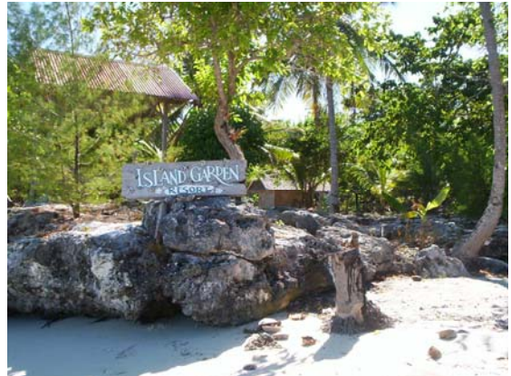
Figure 6. Existing tourist facilities on Hoga are poorly utilised (L Cullen 2004)