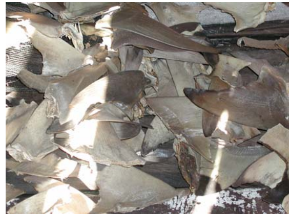
Figure 1. Over-exploitation of sharks within Wakatobi MNP