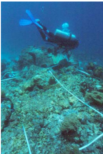
Figure 2. Reef damage from bomb fishing on a Kaledupa reef 2004 (Picture Prof. J. Crabbe)