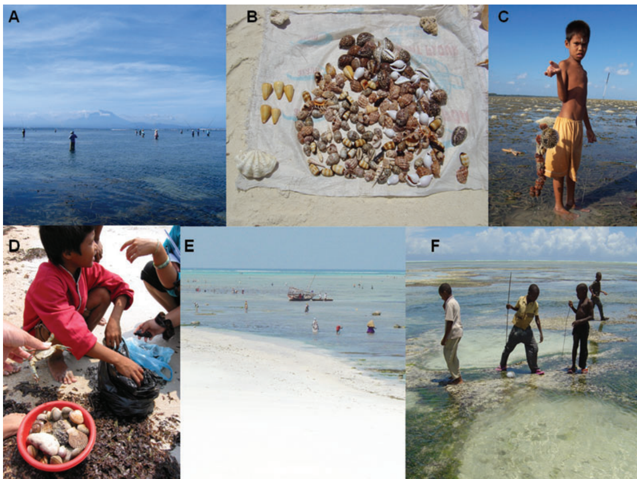
Figure 1 Artisanal fishers collecting seagrass resources at low tide in (A) Seagrass fishing, Bali, Indonesia (B) sale of seagrass shells to tourists, Zanzibar, Tanzania (C) Bajo child fisher, Wakatobi, Indonesia (D) Sepanggor Bay, Malaysia (E) Zanzibar, Tanzania (F) Inhaca Island, Mozambique.

from a single habitat. Although some authors use the term “coral reef ecosystem” to encompass other habitat types, this is rarely defined. Such reporting can have implications for resultant conservation priorities, potentially leading to inappropriate management actions being taken that do not recognize the real value of the range of habitats within a management area.